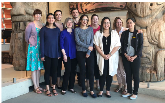
2018-2019 AMSSA Team