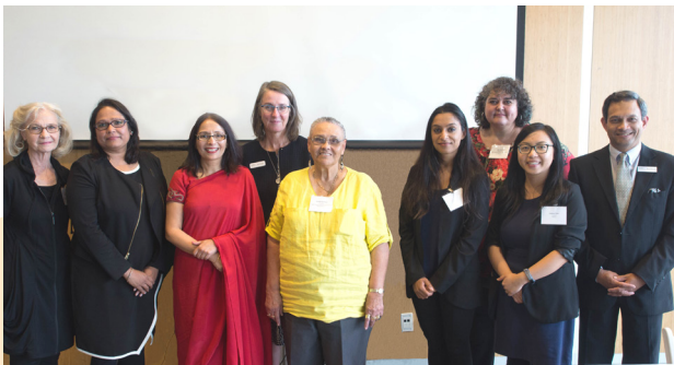
2017 - 2018 AMSSA Board of Directors