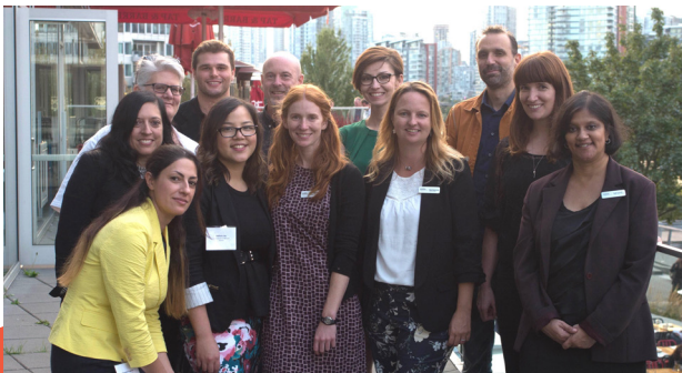
2017 - 2018 AMSSA team