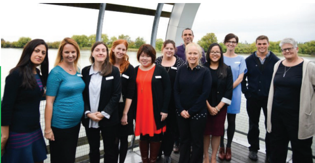
AMSSA staff at the 2016 Annual General Meeting