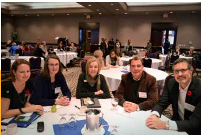
BC Yukon Immigrant Integration Summit