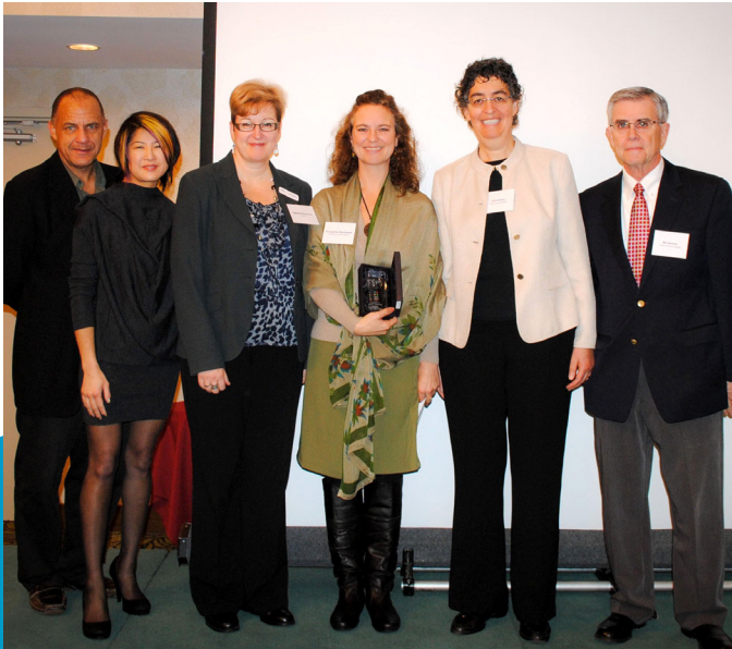
2012 Safe Harbour Champions' Breakfast